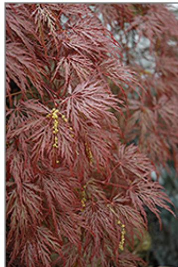
Inaba Shidare Cutleaf Japanese Maple foliage

Inaba Shidare Cutleaf Japanese Maple is recommended for the following landscape applications;