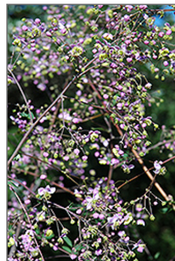
Rochebrun Meadow Rue flowers