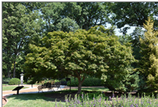
Trompenburg Japanese Maple

This tree does best in full sun to partial shade. You may want to keep it away from hot, dry locations that receive direct afternoon sun or which get reflected sunlight, such as against the south side of a white wall. It prefers to grow in average to moist conditions, and shouldn't be allowed to dry out. It is not particular as to soil pH, but grows best in rich soils. It is somewhat tolerant of urban pollution, and will benefit from being planted in a relatively sheltered location. Consider applying a thick mulch around the root zone in winter to protect it in exposed locations or colder microclimates. This is a selected variety of a species not originally from North America.