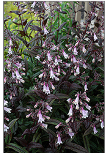
Dark Towers Beard Tongue flowers