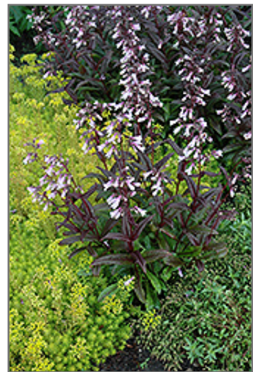
Dark Towers Beard Tongue in bloom