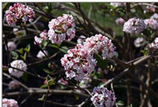
Koreanspice Viburnum flowers