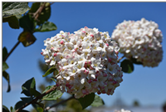
Koreanspice Viburnum flowers

Koreanspice Viburnum is a dense multi-stemmed deciduous shrub with an upright spreading habit of growth. Its average texture blends into the landscape, but can be balanced by one or two finer or coarser trees or shrubs for an effective composition.