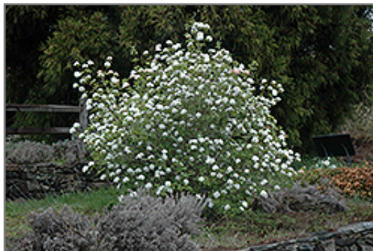
Koreanspice Viburnum in bloom

Koreanspice Viburnum is a dense multi-stemmed deciduous shrub with an upright spreading habit of growth. Its average texture blends into the landscape, but can be balanced by one or two finer or coarser trees or shrubs for an effective composition.