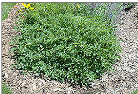
Japanese Bottlebrush