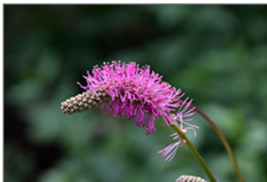
Japanese Bottlebrush flowers

Japanese Bottlebrush is recommended for the following landscape applications;