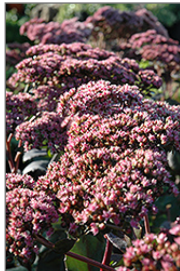
Maestro Stonecrop flowers

This is a relatively low maintenance plant, and is best cleaned up in early spring before it resumes active growth for the season. It is a good choice for attracting bees and butterflies to your yard, but is not particularly attractive to deer who tend to leave it alone in favor of tastier treats. It has no significant negative characteristics.