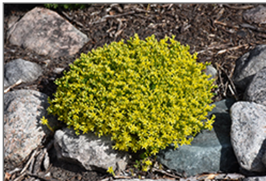
Golden Moss Stonecrop in bloom

Golden Moss Stonecrop is recommended for the following landscape applications;