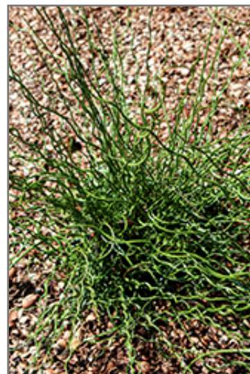
Curly Wurly Corkscrew Rush