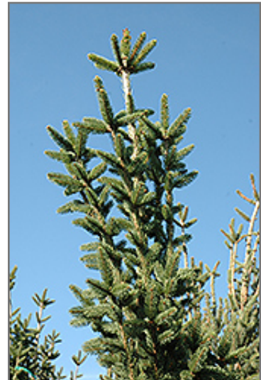
Columnar Norway Spruce foliage