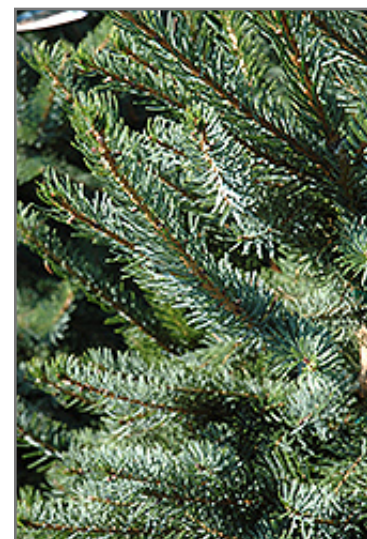
Bruns Spruce foliage