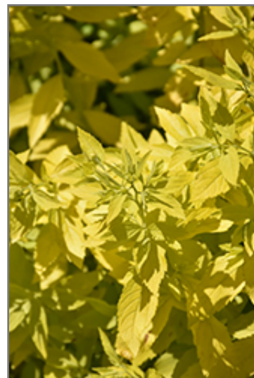
White Gold Spiraea foliage