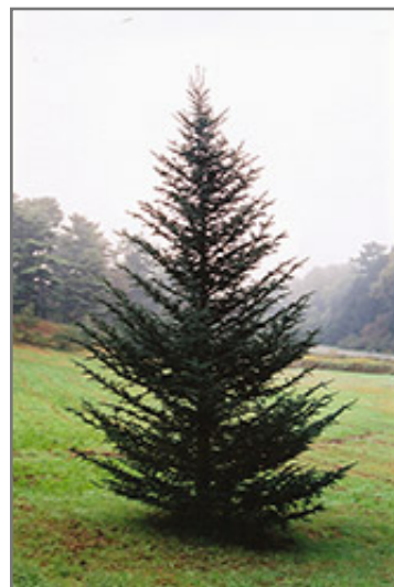
Fraser Fir