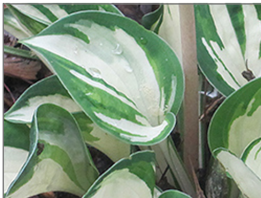
Pandora's Box Hosta foliage