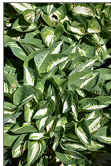
Pandora's Box Hosta foliage