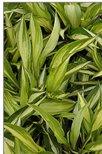
Cherry Berry Hosta foliage