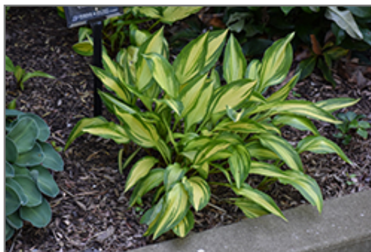
Cherry Berry Hosta