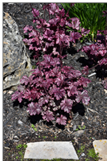
Midnight Rose Coral Bells