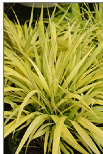
All Gold Hakone Grass foliage