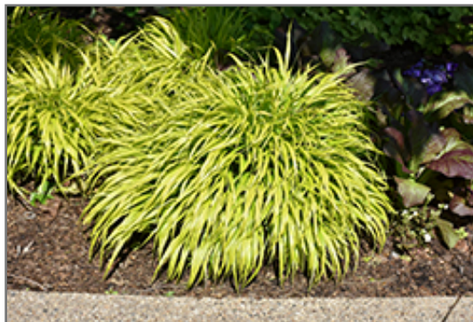
All Gold Hakone Grass

All Gold Hakone Grass is recommended for the following landscape applications;