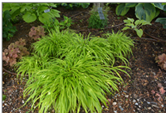
All Gold Hakone Grass