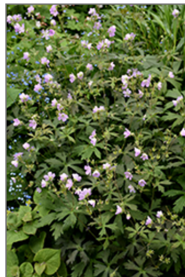
Espresso Cranesbill in bloom

Espresso Cranesbill is a fine choice for the garden, but it is also a good selection for planting in outdoor pots and containers. It is often used as a 'filler' in the 'spiller-thriller-filler' container combination, providing a mass of flowers and foliage against which the thriller plants stand out. Note that when growing plants in outdoor containers and baskets, they may require more frequent waterings than they would in the yard or garden.