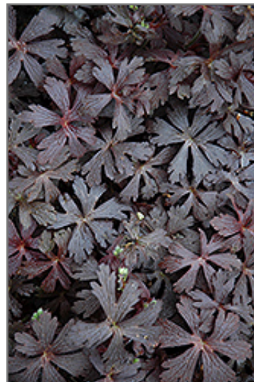
Espresso Cranesbill foliage

This plant will require occasional maintenance and upkeep, and should only be pruned after flowering to avoid removing any of the current season's flowers. Deer don't particularly care for this plant and will usually leave it alone in favor of tastier treats. Gardeners should be aware of the following characteristic(s) that may warrant special consideration;