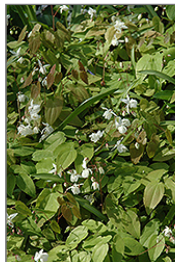
White Bishop's Hat flowers