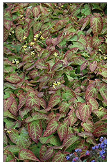
Froehnleiten Bishop's Hat flowers

Froehnleiten Bishop's Hat is a dense herbaceous evergreen perennial with a ground-hugging habit of growth. Its relatively fine texture sets it apart from other garden plants with less refined foliage.