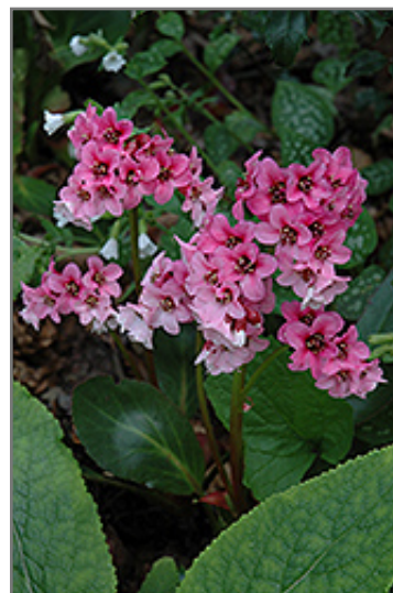
Pink Dragonfly Bergenia flowers

Pink Dragonfly Bergenia is recommended for the following landscape applications;