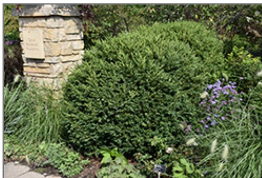
Green Gem Boxwood

Green Gem Boxwood is recommended for the following landscape applications;