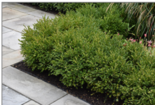
Green Gem Boxwood