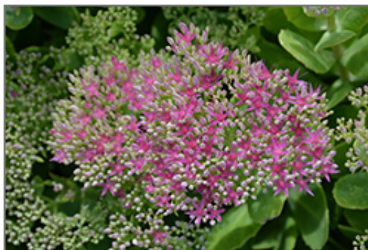
Neon Stonecrop flower buds