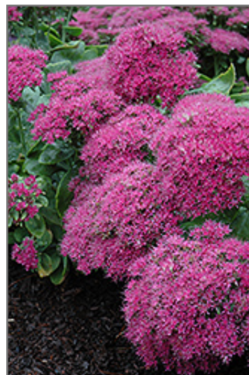
Neon Stonecrop flowers

Neon Stonecrop is a dense herbaceous perennial with an upright spreading habit of growth. Its relatively coarse texture can be used to stand it apart from other garden plants with finer foliage.