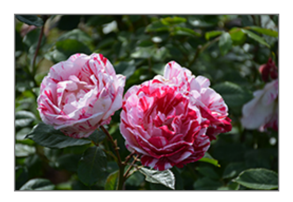
Scentimental Rose flowers

When you see this rose, you want it - the spicy fragrant flowers have bright cherry red flowers prominently streaked in white, simply calling out to be seen, a genuinely tough rose; all roses need full sun and well-drained soil