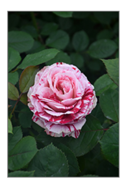
Scentimental Rose flowers

This shrub will require occasional maintenance and upkeep, and is best pruned in late winter once the threat of extreme cold has passed. Gardeners should be aware of the following characteristic(s) that may warrant special consideration;