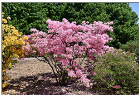
Northern Lights Azalea in bloom