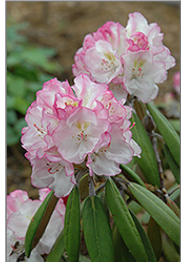
Ken Janeck Rhododendron flowers

Ken Janeck Rhododendron is recommended for the following landscape applications;