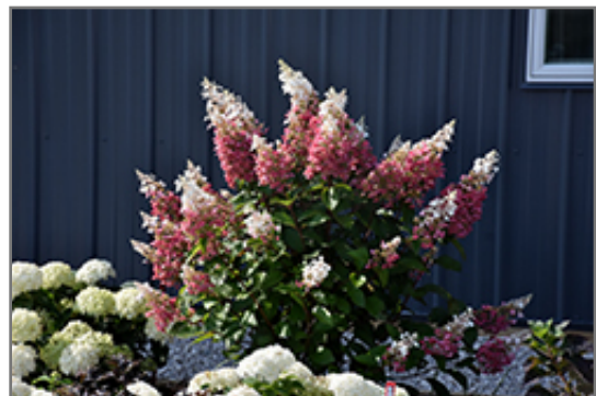
Pinky Winky Hydrangea in bloom