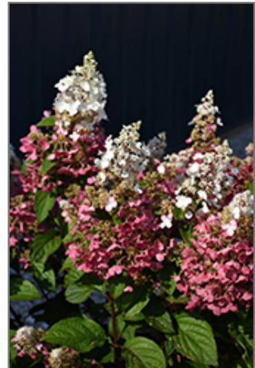
Pinky Winky Hydrangea flowers