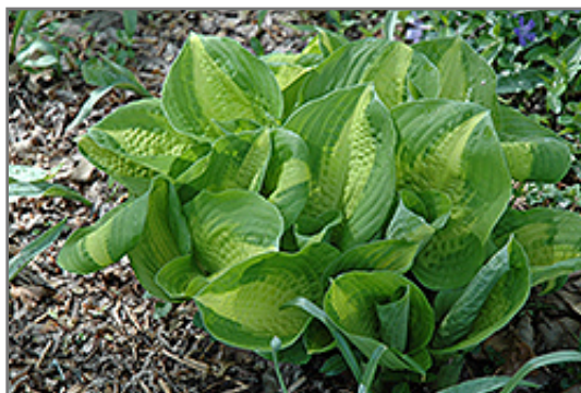
Summer Music Hosta