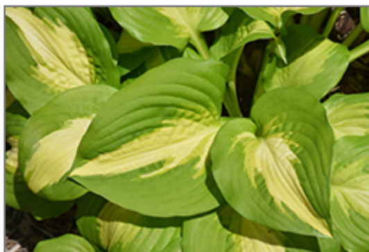
Summer Music Hosta foliage