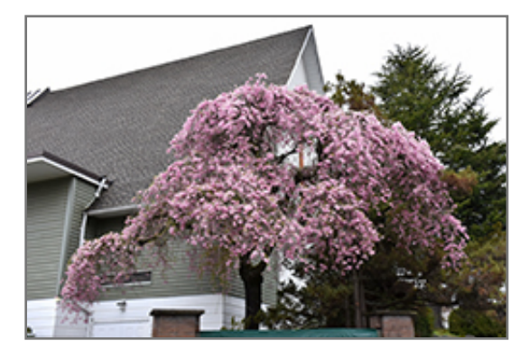
Double Pink Weeping Higan Cherry in bloom

This is a relatively low maintenance tree, and is best pruned in late winter once the threat of extreme cold has passed. It is a good choice for attracting birds to your yard. It has no significant negative characteristics.