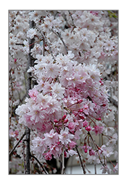
Double Pink Weeping Higan Cherry flowers

Double Pink Weeping Higan Cherry is a deciduous tree with a rounded form and gracefully weeping branches. Its average texture blends into the landscape, but can be balanced by one or two finer or coarser trees or shrubs for an effective composition.