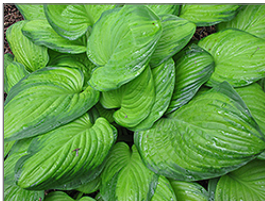
Guacamole Hosta foliage

This is a relatively low maintenance plant, and is best cleaned up in early spring before it resumes active growth for the season. Gardeners should be aware of the following characteristic(s) that may warrant special consideration;