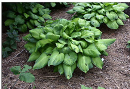
Guacamole Hosta