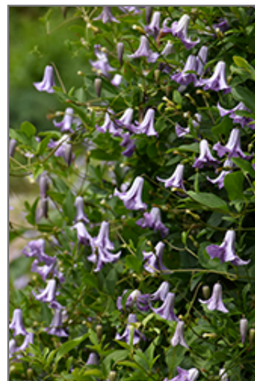
Betty Corning Clematis flowers