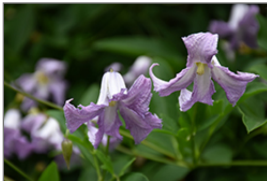
Betty Corning Clematis flowers

This is a relatively low maintenance woody vine. It is a Type 3 clematis; each spring it should be pruned back to within a few inches of the ground, as it flowers on new wood of the season. It is a good choice for attracting hummingbirds to your yard. It has no significant negative characteristics.