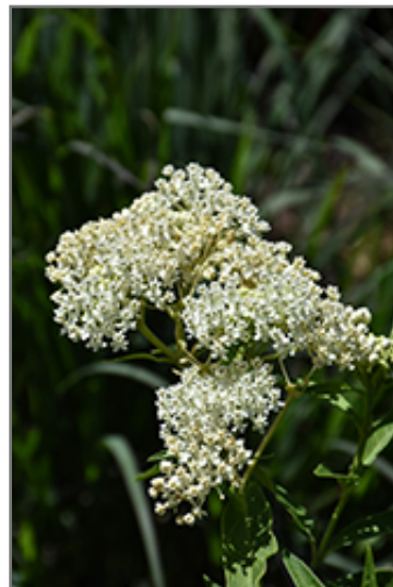
Ice Ballet Milkweed flowers