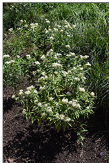
Ice Ballet Milkweed in bloom

This plant does best in full sun to partial shade. It is quite adaptable, preferring to grow in average to wet conditions, and will even tolerate some standing water. It is not particular as to soil type or pH. It is quite intolerant of urban pollution, therefore inner city or urban streetside plantings are best avoided. This is a selection of a native North American species. It can be propagated by division; however, as a cultivated variety, be aware that it may be subject to certain restrictions or prohibitions on propagation.