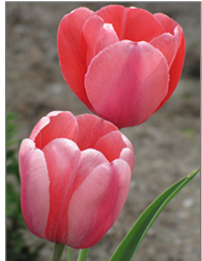
Pink Impression Tulip flowers