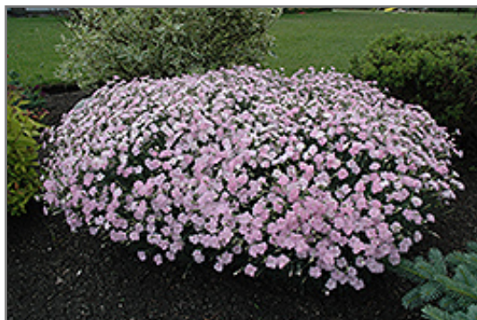
Mountain Mist Pinks in bloom