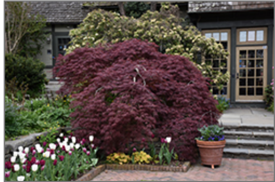
Tamukeyama Japanese Maple

This is a relatively low maintenance tree, and should only be pruned in summer after the leaves have fully developed, as it may 'bleed' sap if pruned in late winter or early spring. It has no significant negative characteristics.