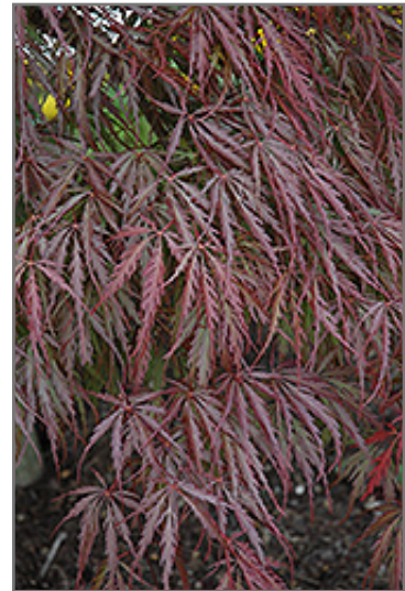
Tamukeyama Japanese Maple foliage