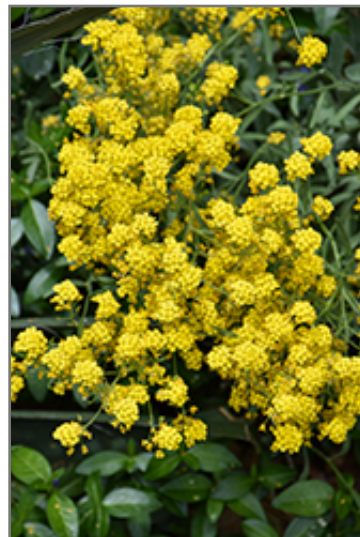
Golden Spring Alpine Alyssum flowers

Golden Spring Alpine Alyssum is a fine choice for the garden, but it is also a good selection for planting in outdoor pots and containers. It is often used as a 'filler' in the 'spiller-thriller-filler' container combination, providing a mass of flowers and foliage against which the thriller plants stand out. Note that when growing plants in outdoor containers and baskets, they may require more frequent waterings than they would in the yard or garden.