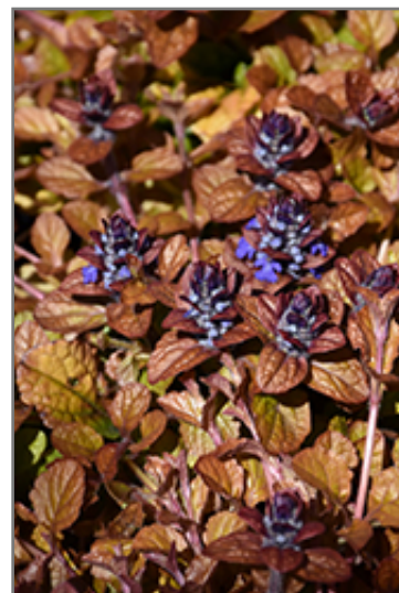
Feathered Friends Parrot Paradise Bugleweed flowers

Feathered Friends Parrot Paradise Bugleweed is a fine choice for the garden, but it is also a good selection for planting in outdoor pots and containers. Because of its spreading habit of growth, it is ideally suited for use as a 'spiller' in the 'spiller-thriller-filler' container combination; plant it near the edges where it can spill gracefully over the pot. Note that when growing plants in outdoor containers and baskets, they may require more frequent waterings than they would in the yard or garden.