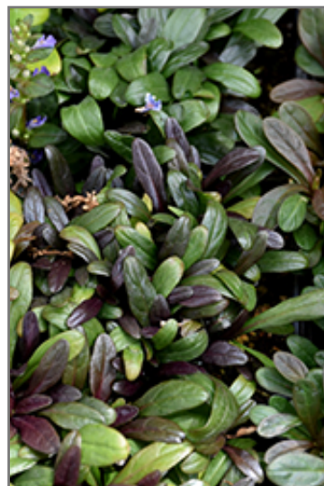
Feathered Friends Noble Nightingale Bugleweed foliage

Feathered Friends Noble Nightingale Bugleweed is a dense herbaceous evergreen perennial with a ground-hugging habit of growth. Its relatively fine texture sets it apart from other garden plants with less refined foliage.