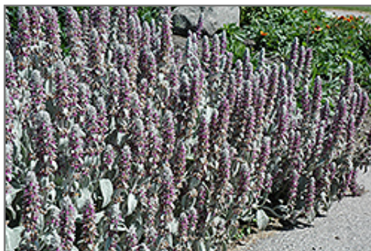
Lamb's Ears in bloom

Lamb's Ears is a fine choice for the garden, but it is also a good selection for planting in outdoor pots and containers. It can be used either as 'filler' or as a 'thriller' in the 'spiller-thriller-filler' container combination, depending on the height and form of the other plants used in the container planting. Note that when growing plants in outdoor containers and baskets, they may require more frequent waterings than they would in the yard or garden.