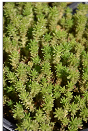
Six Row Stonecrop foliage

Six Row Stonecrop is a fine choice for the garden, but it is also a good selection for planting in outdoor pots and containers. Because of its spreading habit of growth, it is ideally suited for use as a 'spiller' in the 'spiller-thriller-filler' container combination; plant it near the edges where it can spill gracefully over the pot. Note that when growing plants in outdoor containers and baskets, they may require more frequent waterings than they would in the yard or garden.