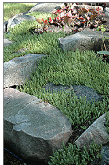
Six Row Stonecrop