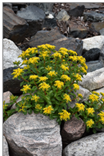
Russian Stonecrop in bloom