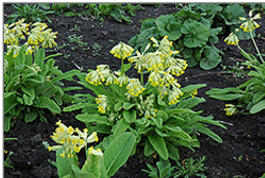
English Cowslip in bloom

English Cowslip will grow to be only 4 inches tall at maturity extending to 10 inches tall with the flowers, with a spread of 8 inches. When grown in masses or used as a bedding plant, individual plants should be spaced approximately 6 inches apart. Its foliage tends to remain low and dense right to the ground. It grows at a fast rate, and under ideal conditions can be expected to live for approximately 5 years. As an herbaceous perennial, this plant will usually die back to the crown each winter, and will regrow from the base each spring. Be careful not to disturb the crown in late winter when it may not be readily seen!