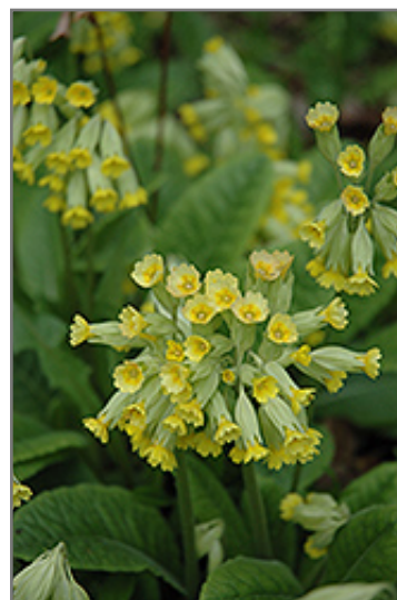
English Cowslip flowers