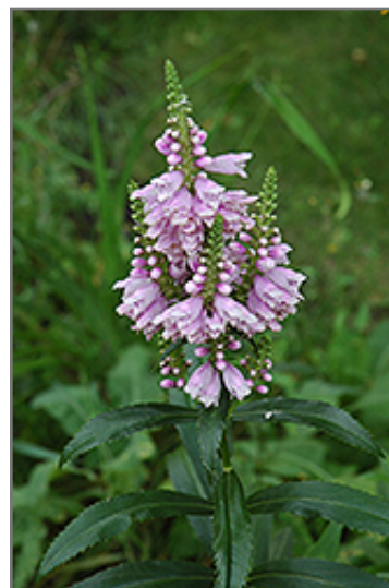
Obedient Plant flowers

Obedient Plant is recommended for the following landscape applications;