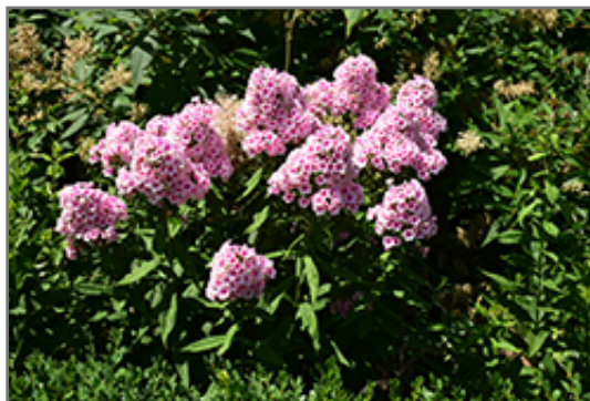
Bright Eyes Garden Phlox in bloom