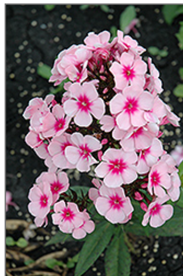
Bright Eyes Garden Phlox flowers

Bright Eyes Garden Phlox is a fine choice for the garden, but it is also a good selection for planting in outdoor pots and containers. With its upright habit of growth, it is best suited for use as a 'thriller' in the 'spiller-thriller-filler' container combination; plant it near the center of the pot, surrounded by smaller plants and those that spill over the edges. It is even sizeable enough that it can be grown alone in a suitable container. Note that when growing plants in outdoor containers and baskets, they may require more frequent waterings than they would in the yard or garden.