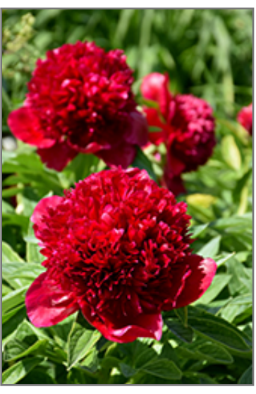
Red Charm Peony flowers

Red Charm Peony will grow to be about 30 inches tall at maturity, with a spread of 3 feet. When grown in masses or used as a bedding plant, individual plants should be spaced approximately 30 inches apart. The flower stalks can be weak and so it may require staking in exposed sites or excessively rich soils. It grows at a slow rate, and under ideal conditions can be expected to live for approximately 20 years. As an herbaceous perennial, this plant will usually die back to the crown each winter, and will regrow from the base each spring. Be careful not to disturb the crown in late winter when it may not be readily seen!