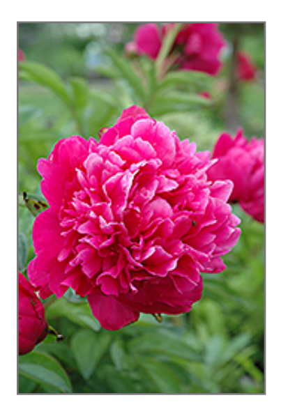
Kansas Peony flowers