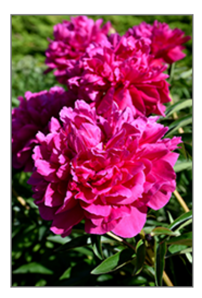
Kansas Peony flowers