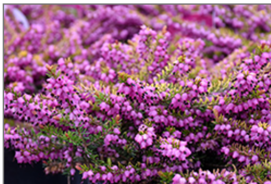
Eva Gold Heath flowers