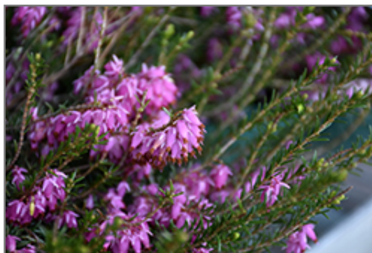
Pink Spangles Heath flowers

Pink Spangles Heath is recommended for the following landscape applications;