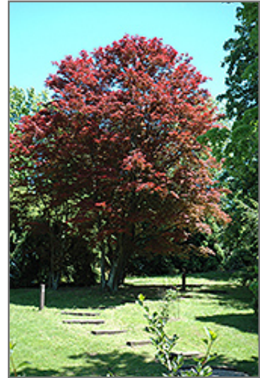
Purple-Leaf Japanese Maple

This tree does best in full sun to partial shade. You may want to keep it away from hot, dry locations that receive direct afternoon sun or which get reflected sunlight, such as against the south side of a white wall. It prefers to grow in average to moist conditions, and shouldn't be allowed to dry out. This plant should not require much in the way of fertilizing once established, although it may appreciate a shot of general-purpose fertilizer from time to time early in the growing season. It is not particular as to soil pH, but grows best in rich soils. It is somewhat tolerant of urban pollution. Consider applying a thick mulch around the root zone in winter to protect it in exposed locations or colder microclimates. This is a selected variety of a species not originally from North America.