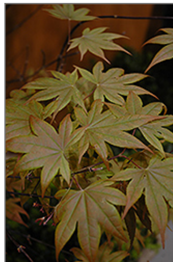
Purple-Leaf Japanese Maple foliage