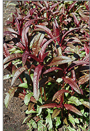
Firecracker Loosestrife foliage

Firecracker Loosestrife is a fine choice for the garden, but it is also a good selection for planting in outdoor pots and containers. With its upright habit of growth, it is best suited for use as a 'thriller' in the 'spiller-thriller-filler' container combination; plant it near the center of the pot, surrounded by smaller plants and those that spill over the edges. It is even sizeable enough that it can be grown alone in a suitable container. Note that when growing plants in outdoor containers and baskets, they may require more frequent waterings than they would in the yard or garden.